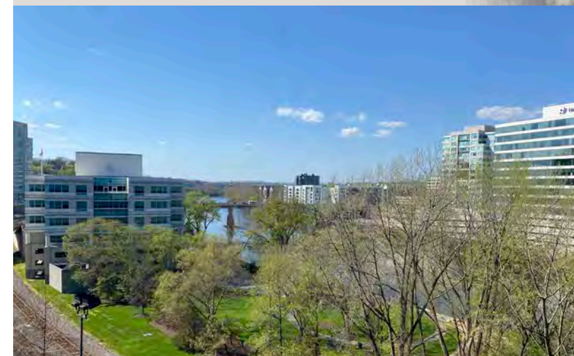
COMING SUMMER 2023 – PATIO RENOVATION VIEW FROM OUTDOOR PATIO