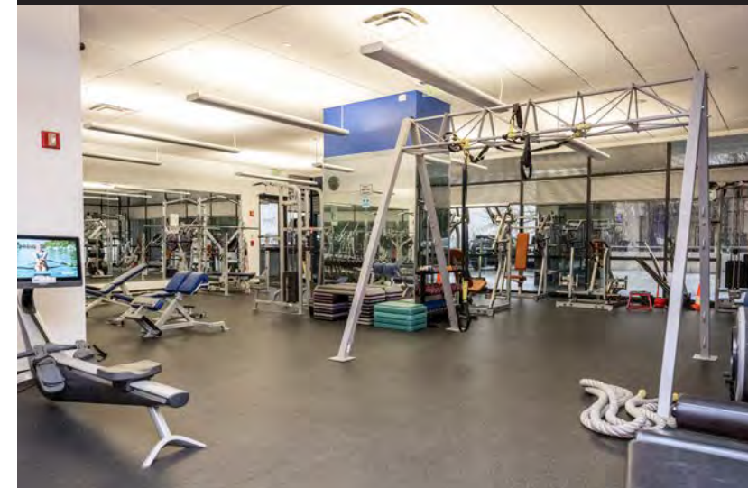
ON-SITE FITNESS CENTER